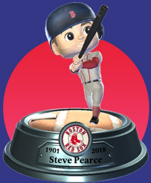
MLB Crypto Baseball